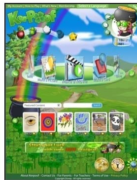
Kerpoof Celebrates St. Patrick's Day